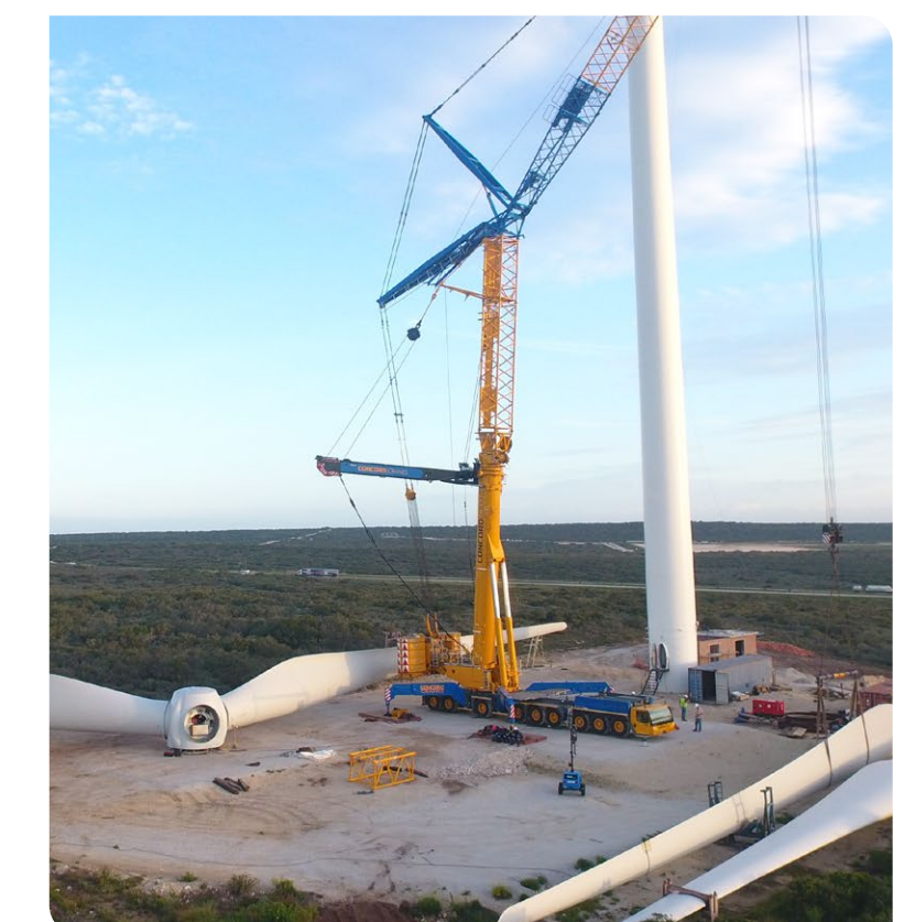
Wind Farms Over 80x wind turbines erected and working alongside 8x wind farms.