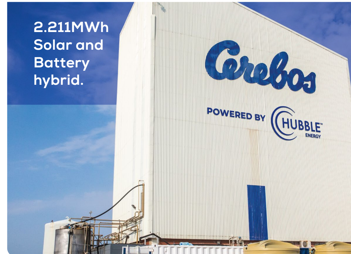
2.211MWh Solar and Battery hybrid.