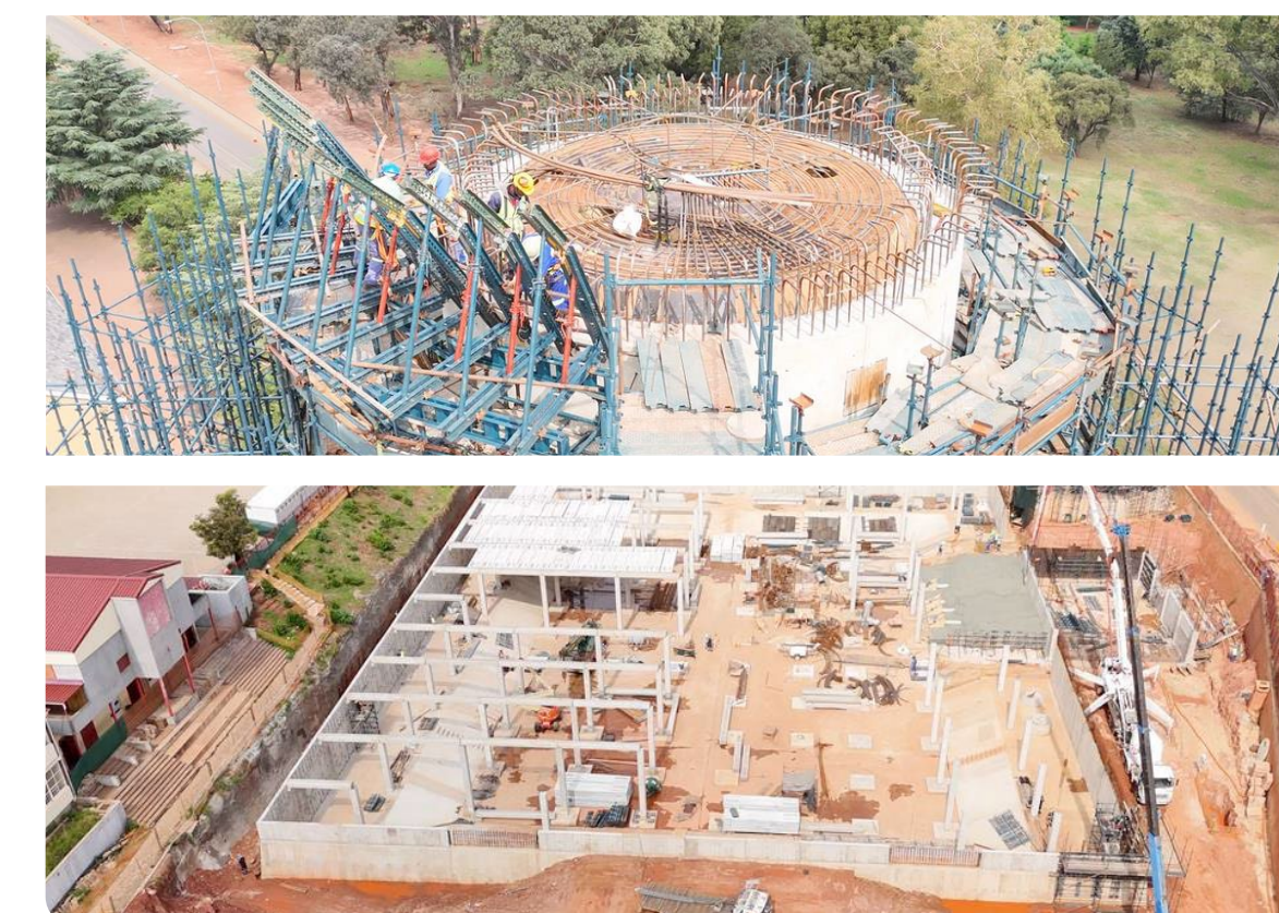
Brixton Water Tower, Johannesburg With a capacity of 26 million litres, the tower is a crucial component to address Johannesburg water storage and supply challenges.