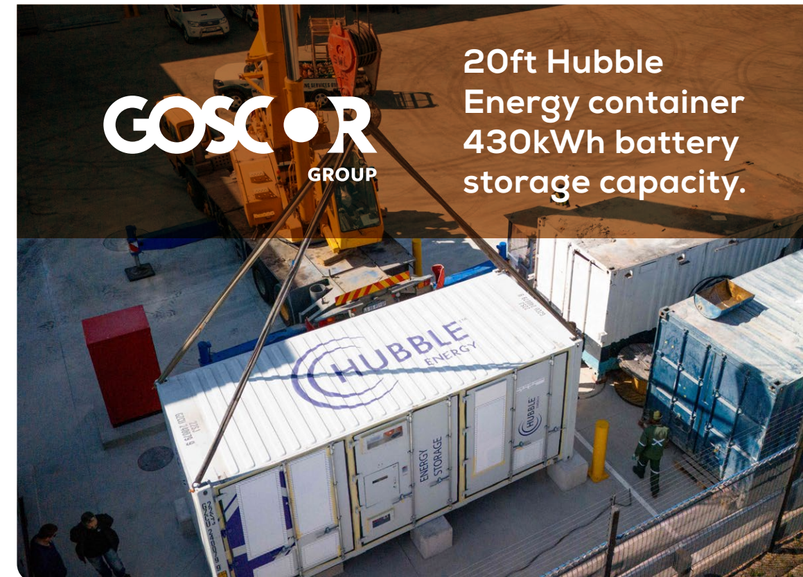
20ft Hubble Energy container 430kWh battery storage capacity.

Investing in renewable energy with a significant impact on our bottom line and lasting impact on the environment.